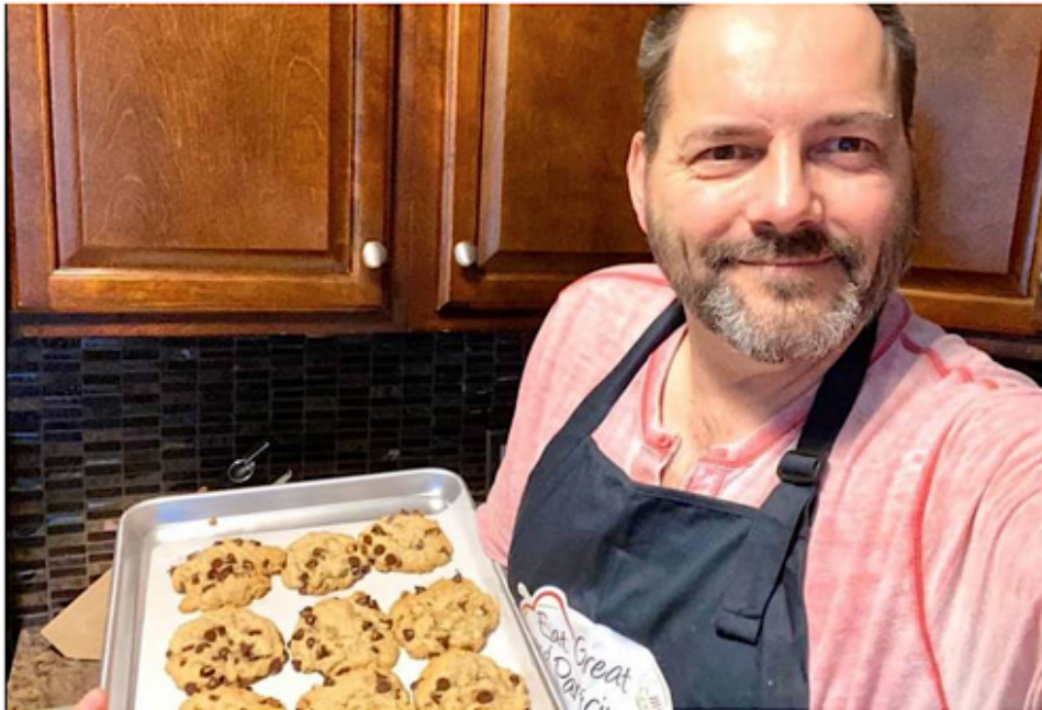
Dover Mayor Tony Keats is shown here with a batch of cookies he made during the first segment of Cooking with the Mayor on March 31.