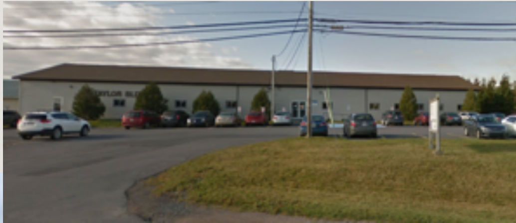
Provincial Gov't Offices